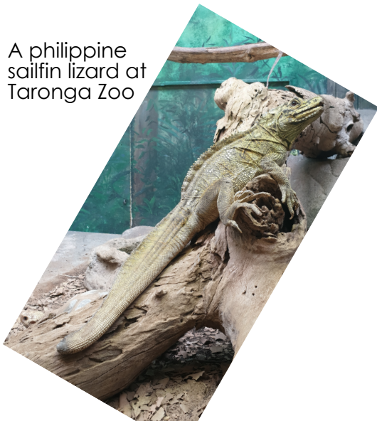
A philippine sailfin lizard at Taronga Zoo

Of the animals that move along the ground, these are unclean for you: the weasel, the rat, any kind of great lizard, the gecko, the monitor lizard, the wall lizard, the skink and the chameleon.