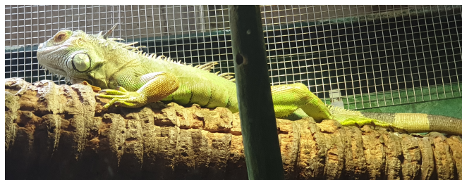
Jub Jub the Iguana at Taronga Zoo

Of the animals that move along the ground, these are unclean for you: the weasel, the rat, any kind of great lizard, the gecko, the monitor lizard, the wall lizard, the skink and the chameleon.