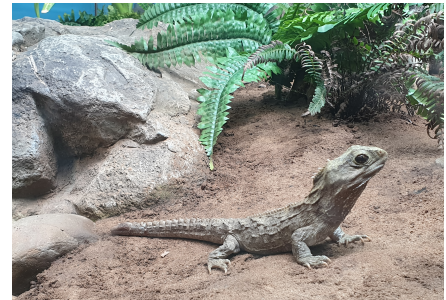
Tuatara Lizard at Taronga zoo