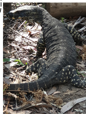
Casey, the Monitor lizard lives at Thirlmere campground

TAKE A PHOTO OF YOUR ROCK AND PASTE IT HERE